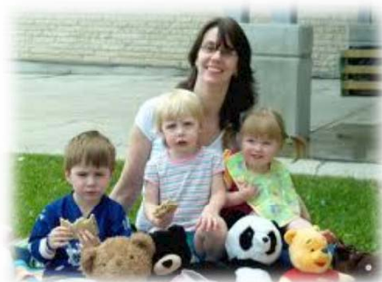
Annual Teddy Bear's Picnic